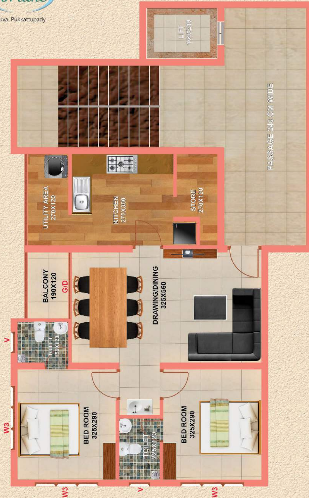
APARTMENT - A AREA : 937 SFT