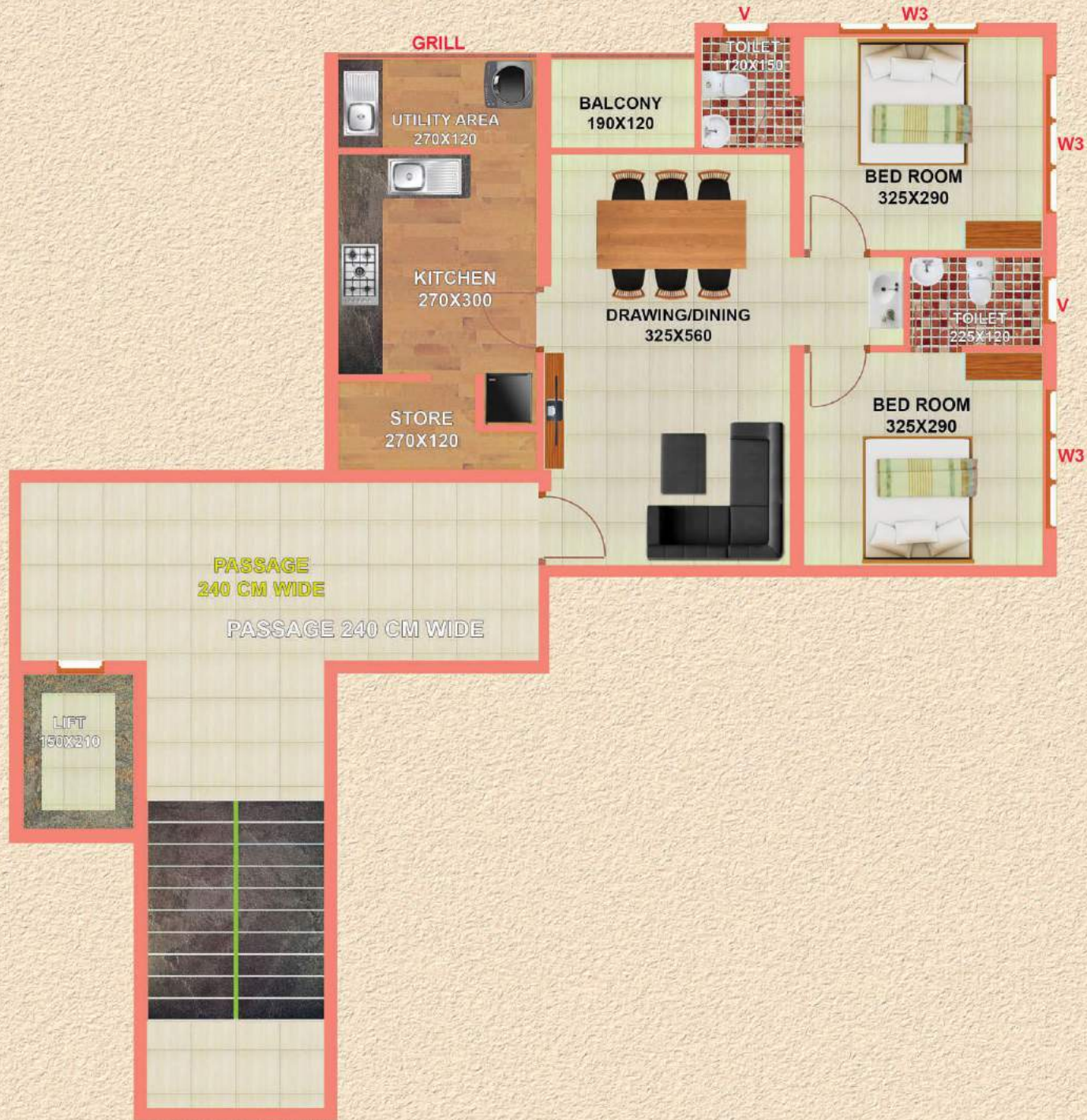
APPARTMENT - E AREA : 937 SFT