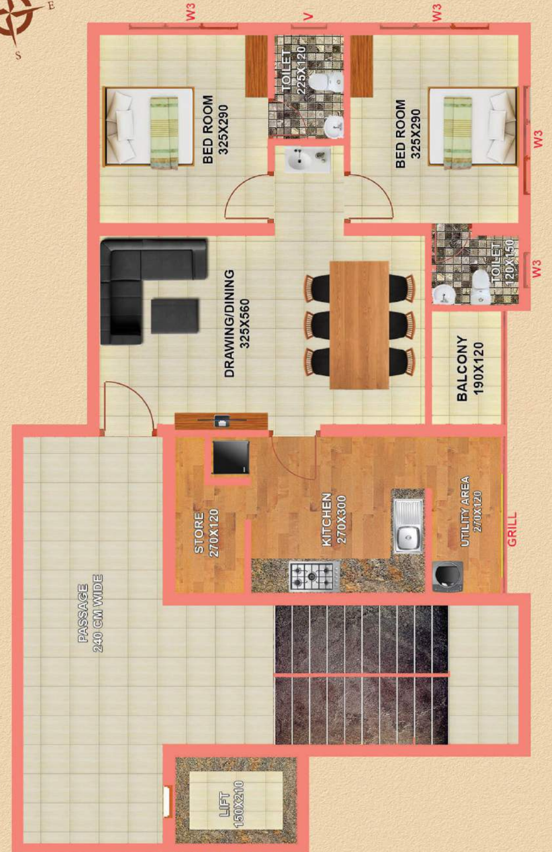
APPARTMENT - F AREA : 937 SFT